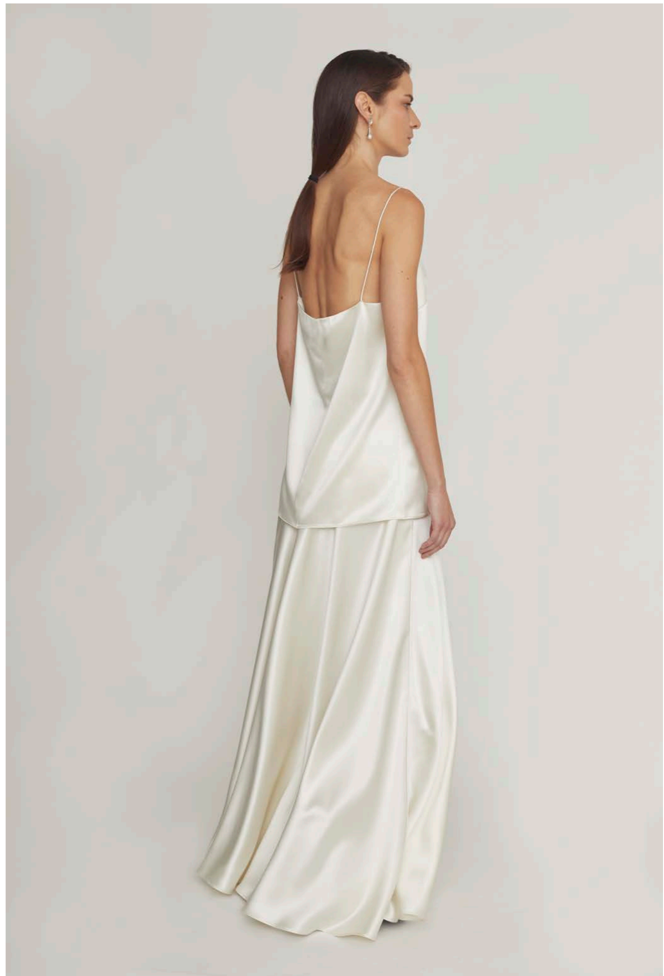
LOOK 21 Antonia Top in Ivory + Antonia Skirt in Ivory