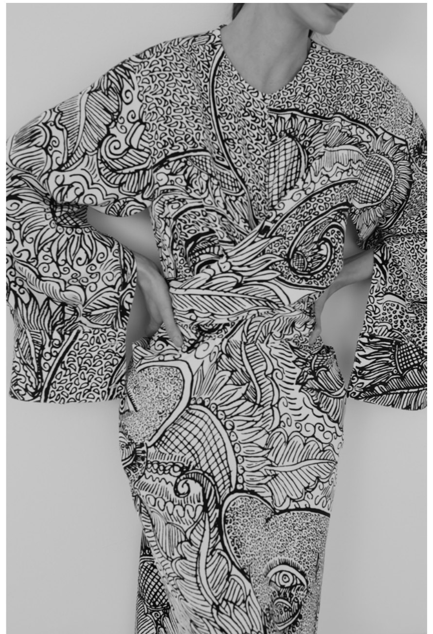
LOOK 19 Elsa Dress in JGR print