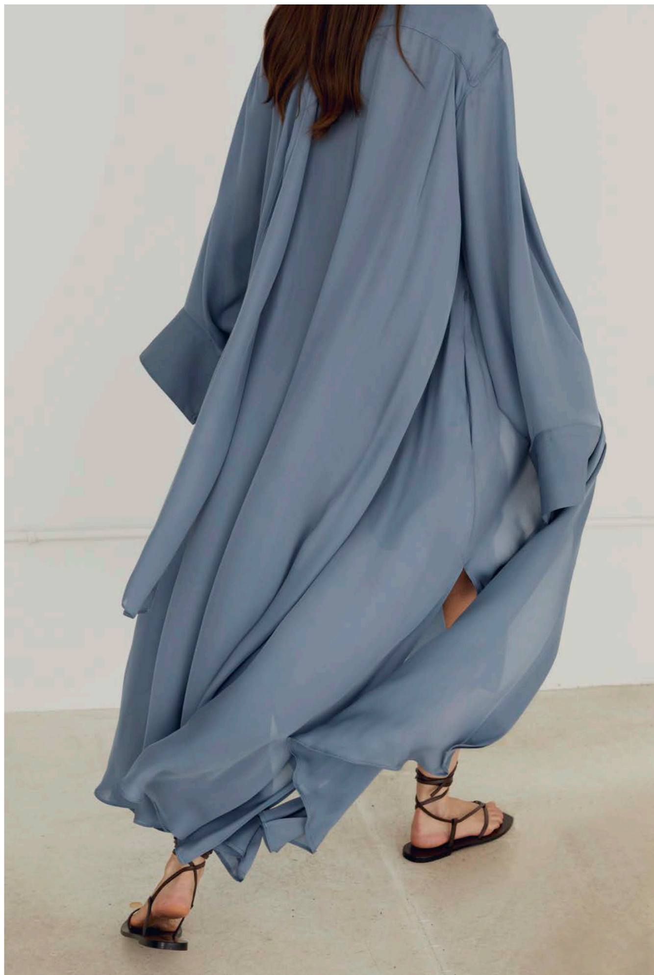
LOOK 11 Joanna Dress in Dresden Blue