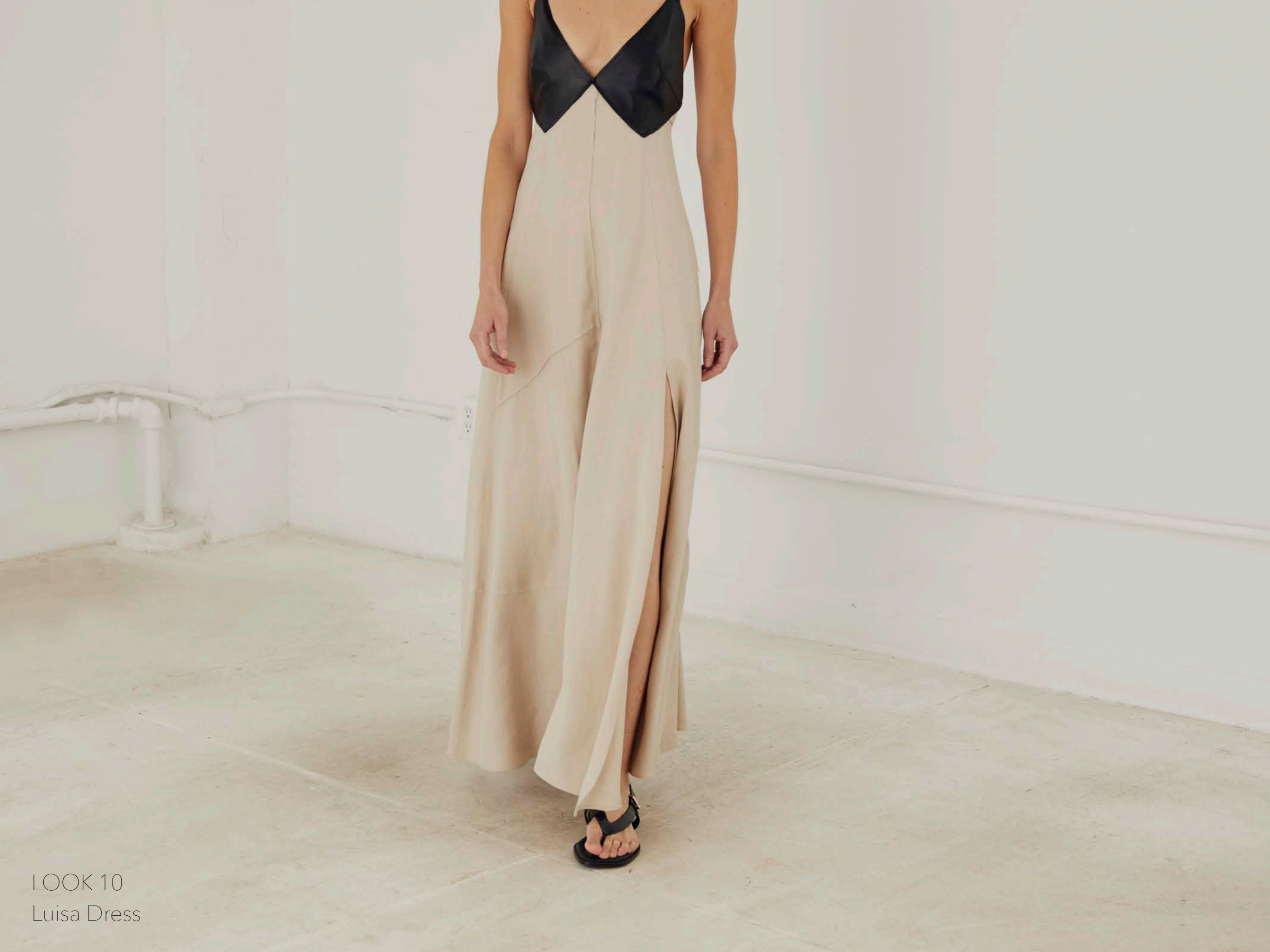
LOOK 10 Luisa Dress