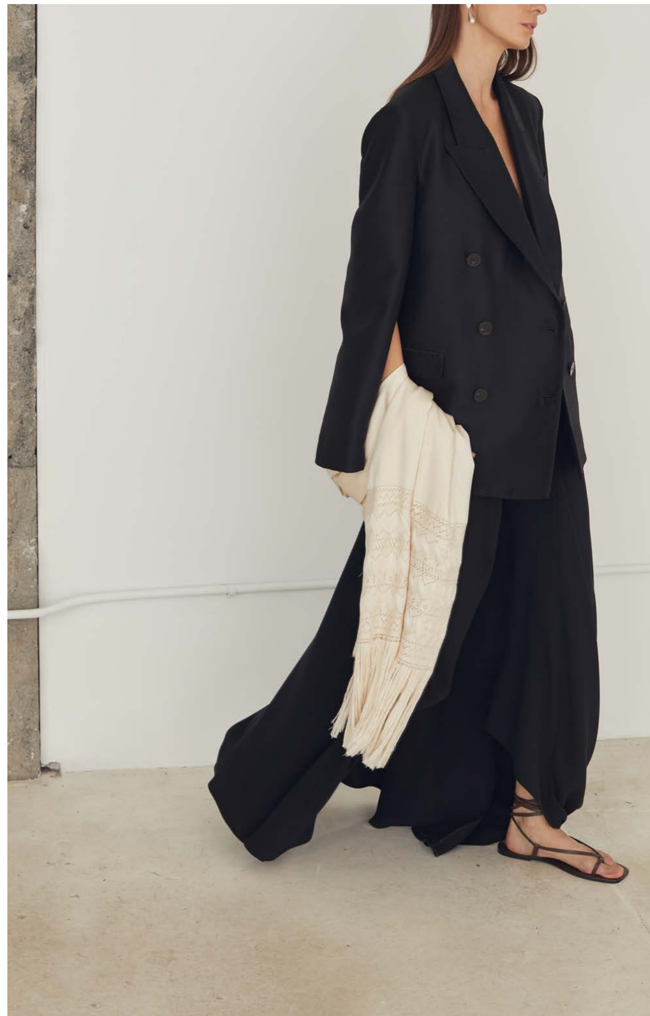
LOOK 14 Victoria Blazer, Sara Skirt in Black + Rebozo