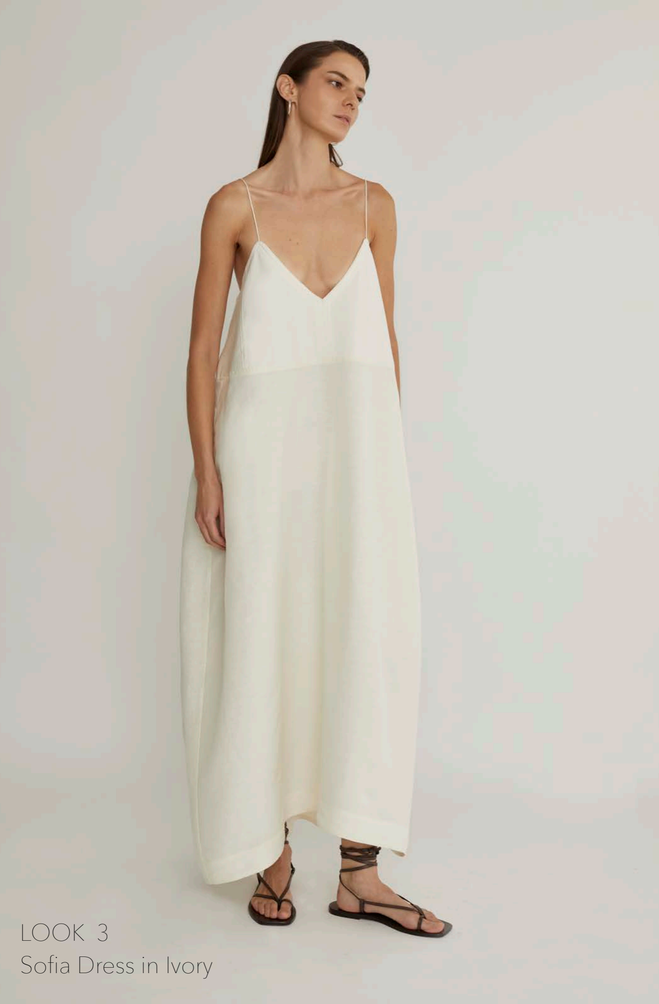
LOOK 3 Sofia Dress in Ivory