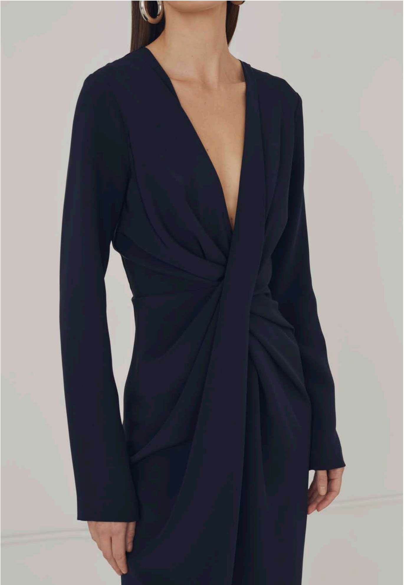
LOOK 17 Valentina Dress