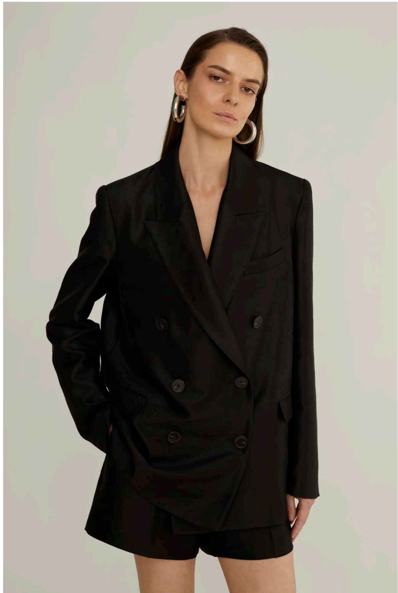
LOOK 4 Victoria Blazer + Victoria Short