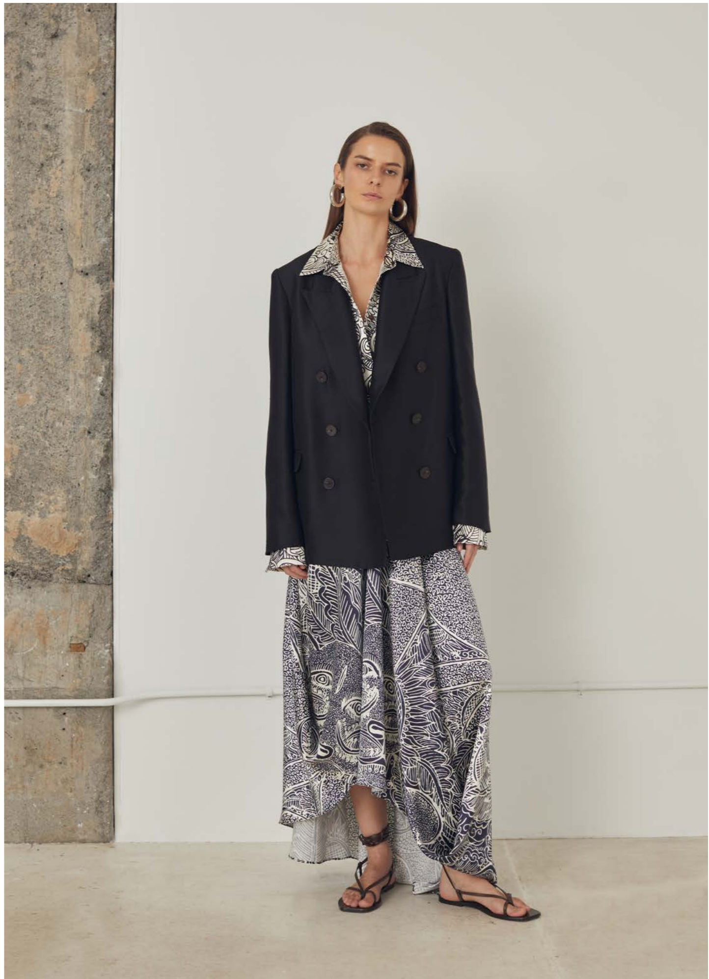
LOOK 16 JGR Shirt, Sara Skirt in JGR print + Victoria Blazer