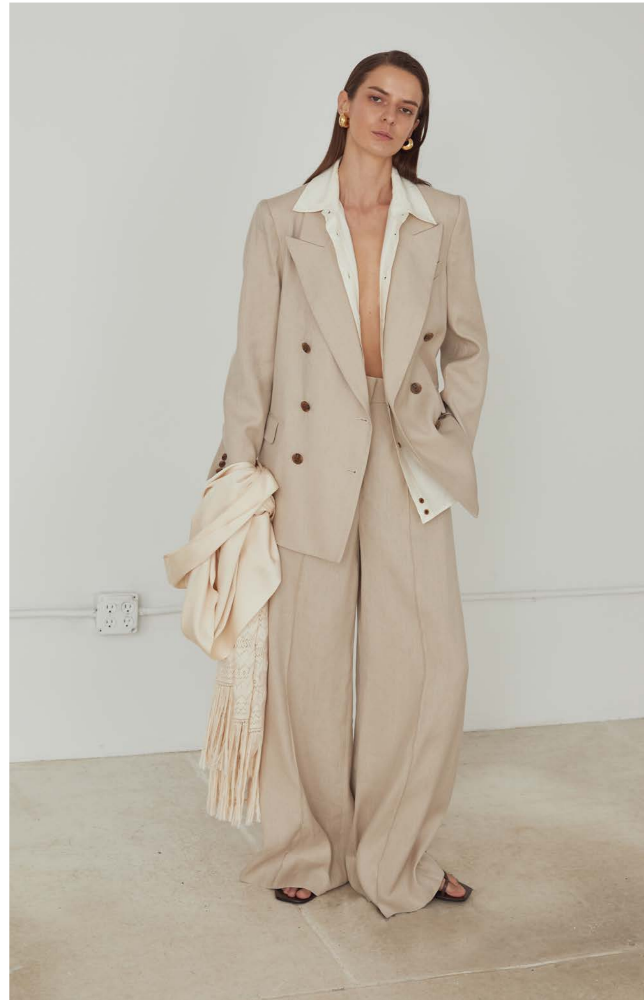
LOOK 9 Luisa Blazer, Ella Shirt in Ivory Linen + Luisa Trousers