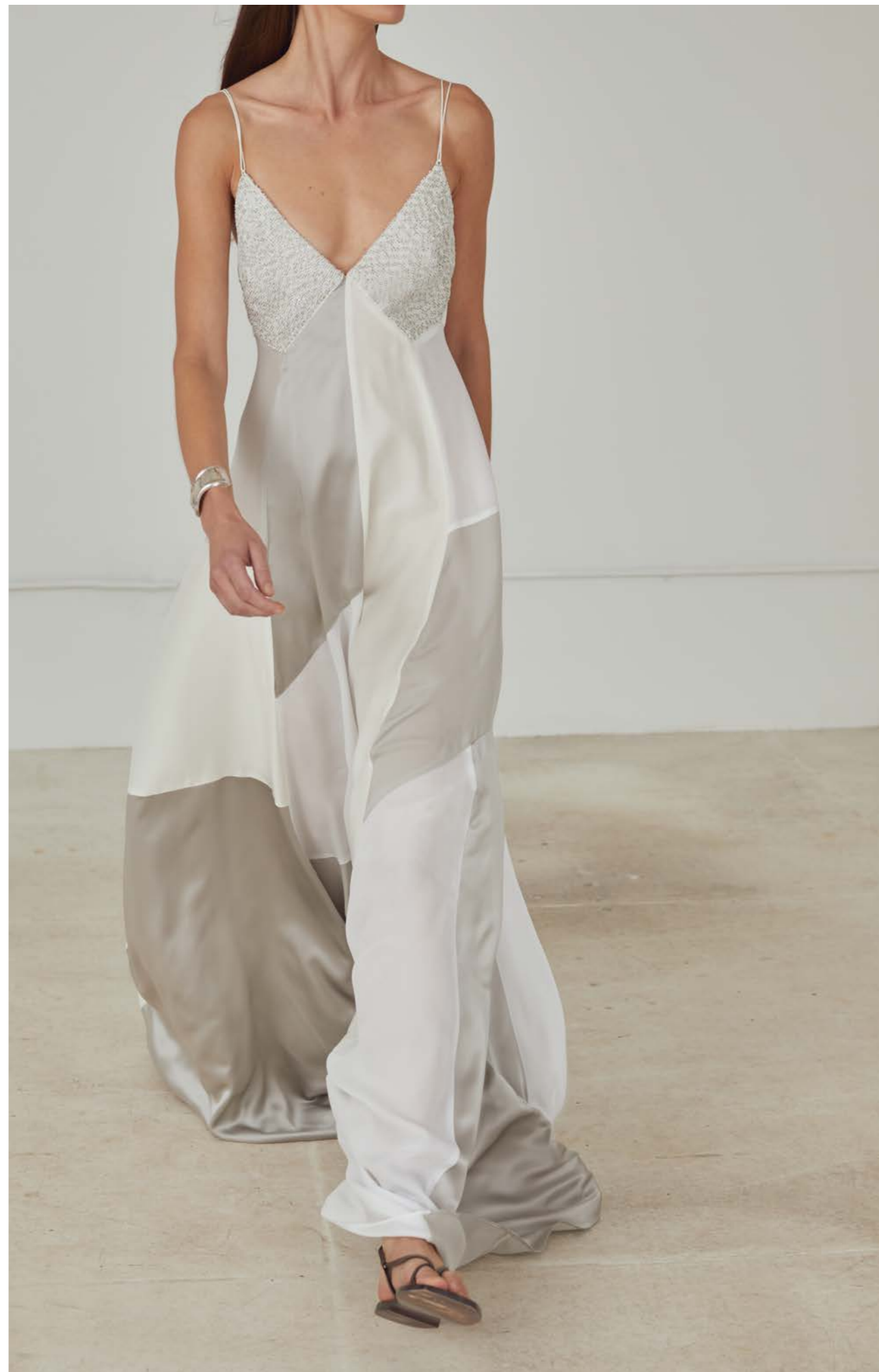
LOOK 24 Maya Dress