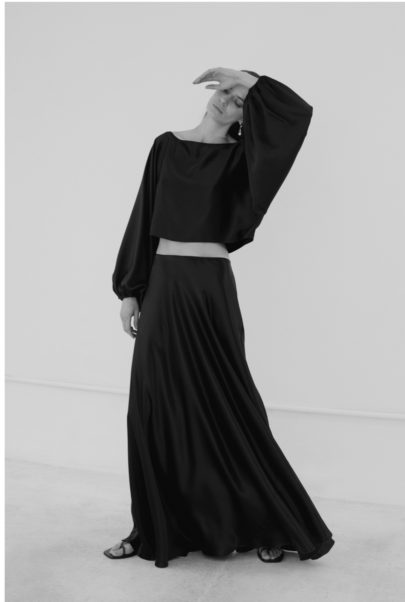
LOOK 5 Dolores Top in Black + Antonia Skirt in Black