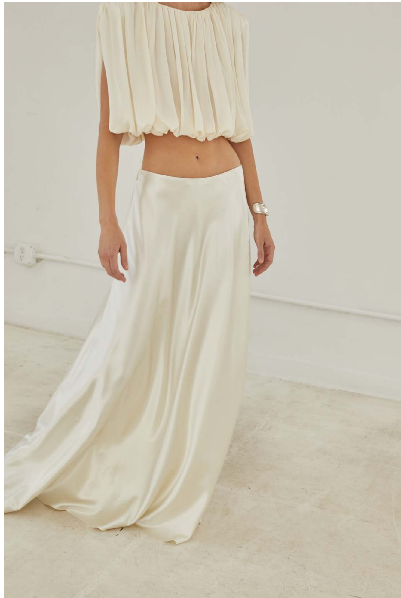
LOOK 1 Penelope Top in Ivory + Antonia Skirt in Ivory