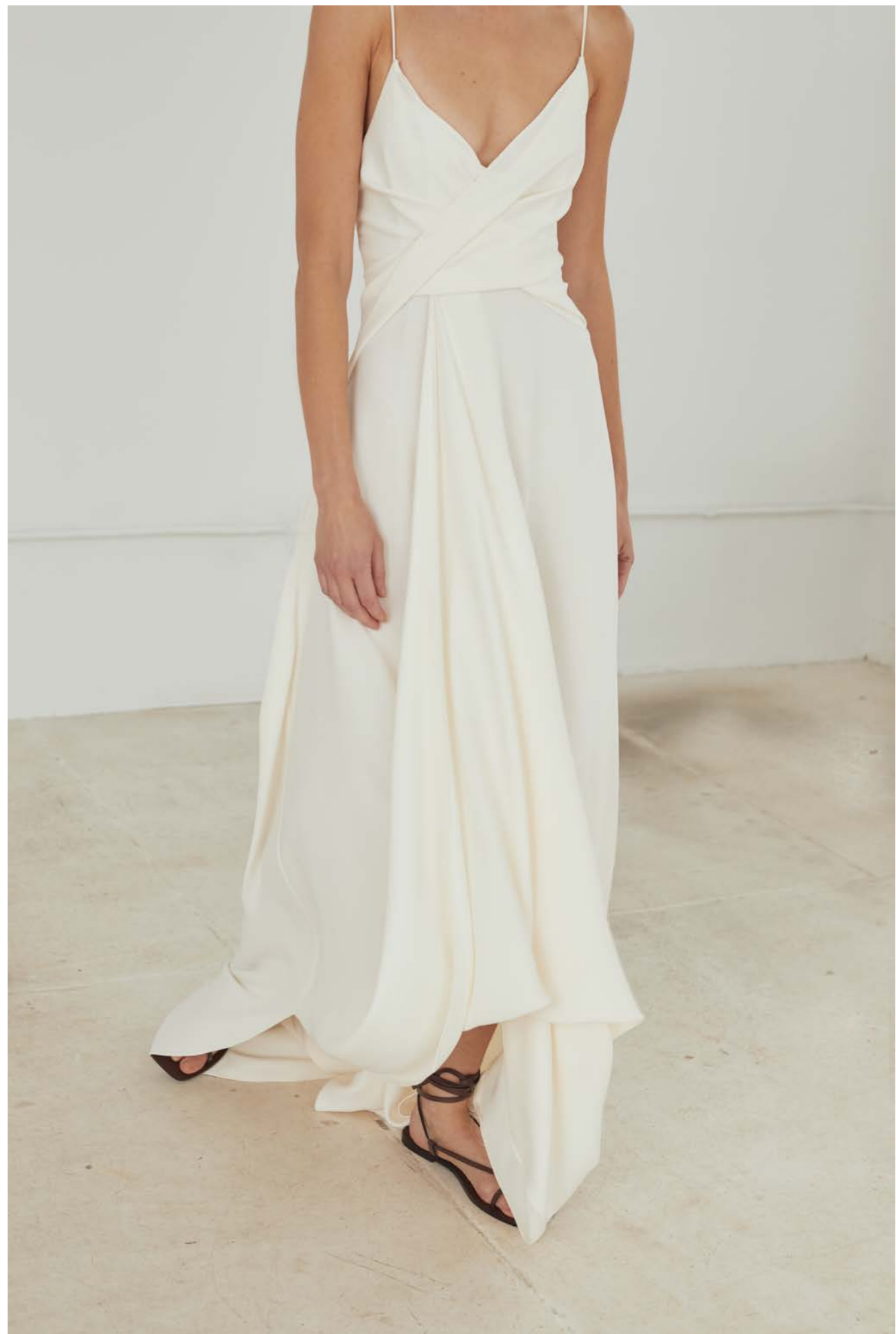
LOOK 20 Lola Dress in Ivory