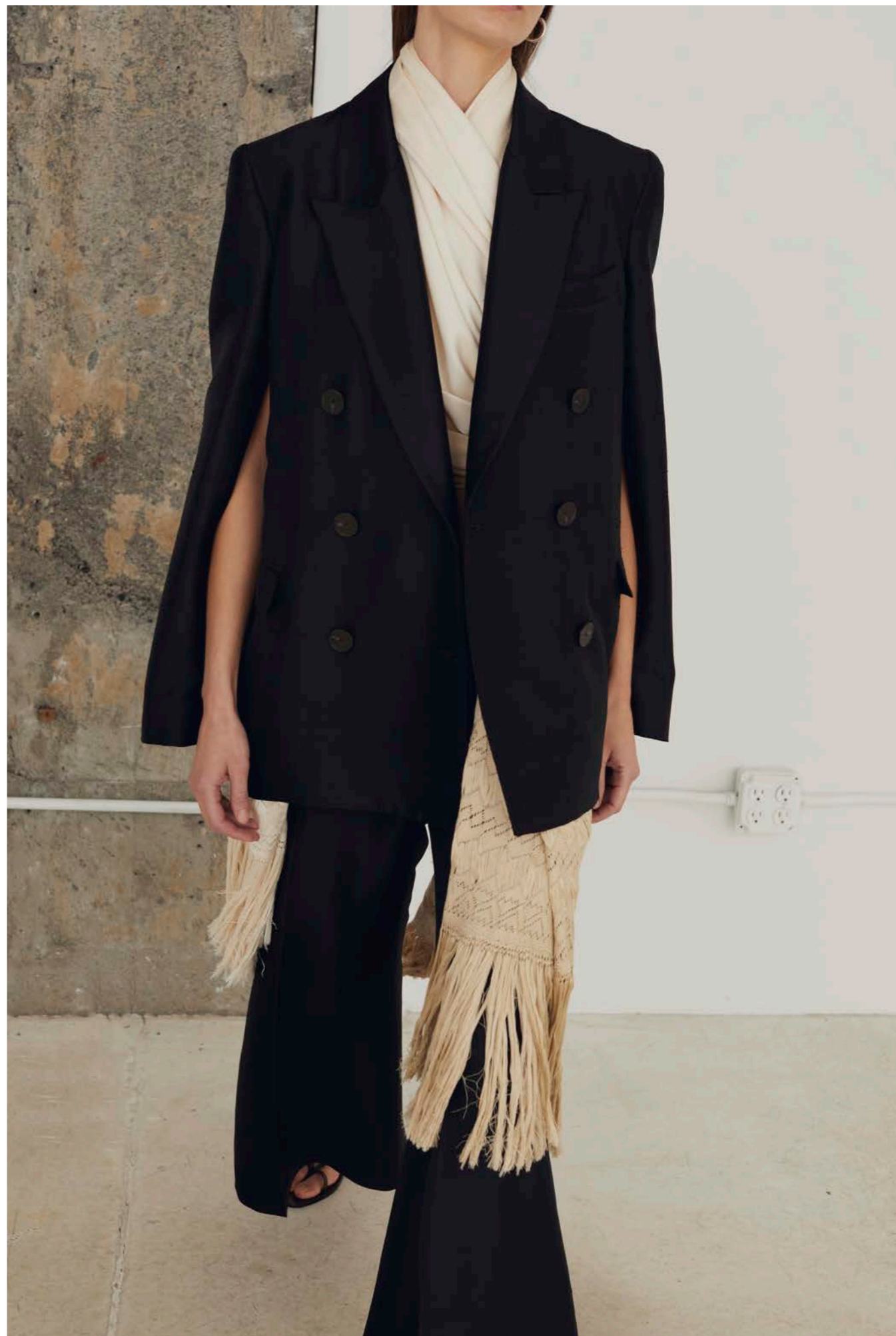
LOOK 12 Victoria Blazer, Victoria Trouser + Rebozo